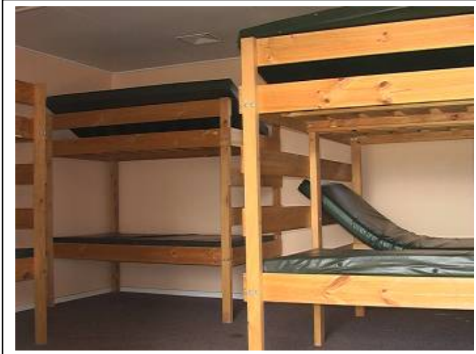
Bunk beds with vinyl covered foam mattress